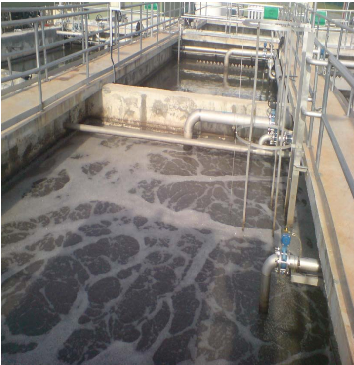
▲ AICAR reactor in petrochemical plant, Pasir Gudang

AICAR operates in continuous mode on wastewater feeding and discharging in batch treatment. AICAR improves large flow variation of batch system and suit to large flow systems.