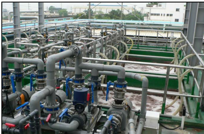
▲ MBR treating wastewater from glass fiber manufacturing plant