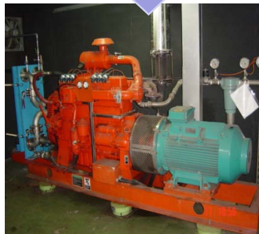
▲ Power generation from food & beverage industry wastewater, Taiwan