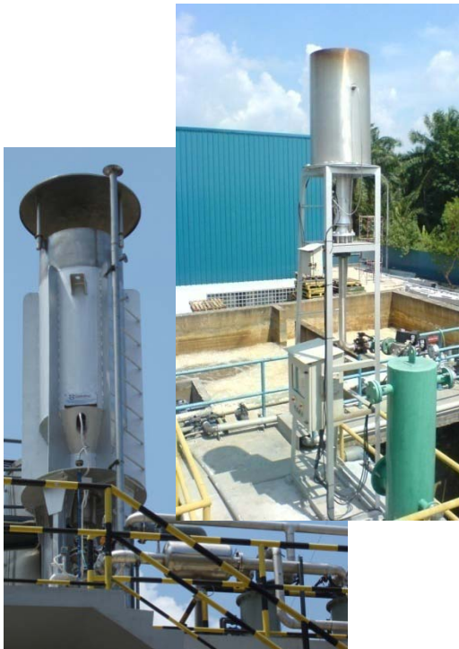
▲ Left: Enclosed flare system; Right: Semi-Open flare system