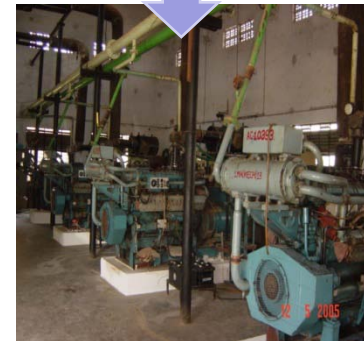
▲ 1MW power generation plant, India